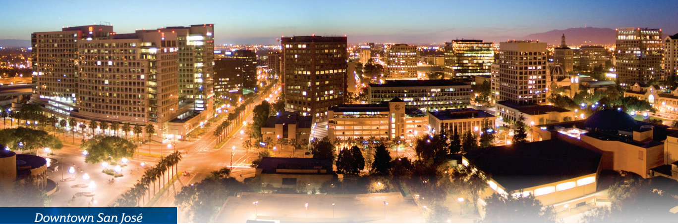
Downtown San José